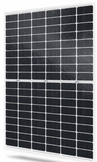
Transparent, dual-sided, frameless glass-glass solar modules